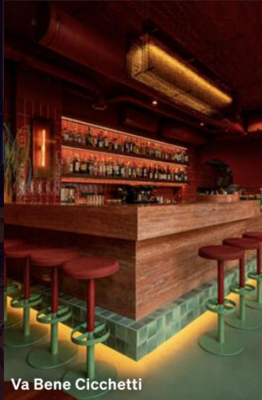
Va Bene Cicchetti