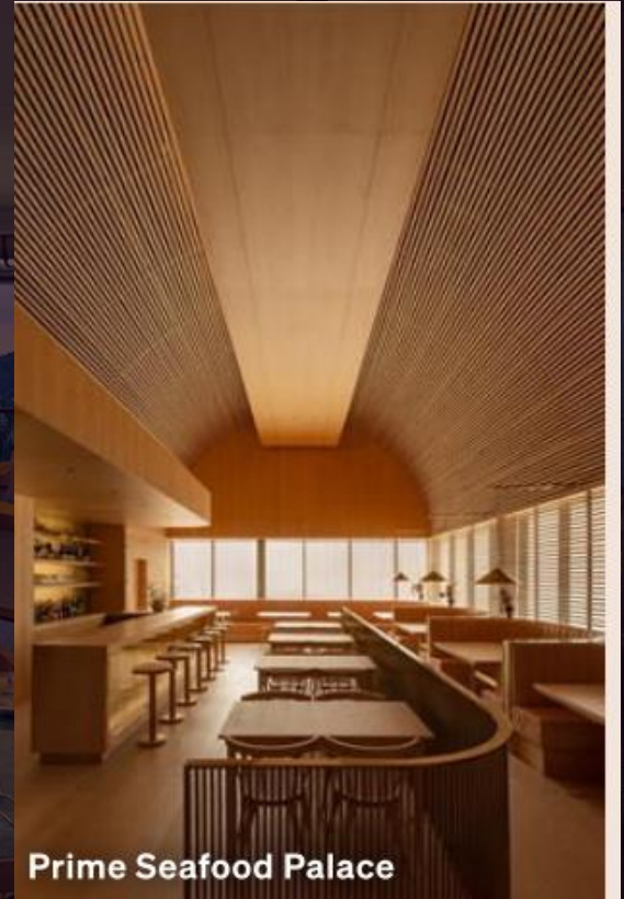
Prime Seafood Palace